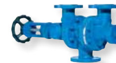
Best Availability Change-over Valve